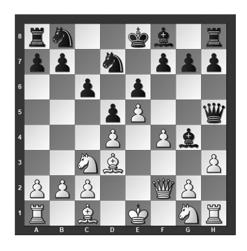
What is White's best move?

Here Black should have swallowed his pride and dropped a pawn to save his pieces with 9...Ne4 10.Nxe4 dxe4 11.Bxe4 Be7 12.Ne2 Bxe2 13.Qxe2 Bh4+ 14.Kd1 Qxe2+ 15.Kxe2 and White has the extra pawn and the bishop pair.